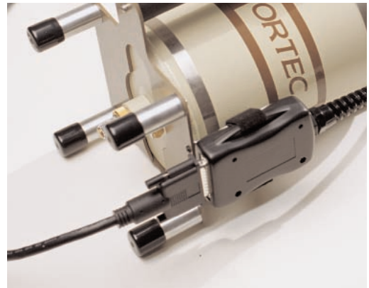
SMART-1 Detector Interface Module.

The DigiDART/SMART-1 combination also guarantees spectrum authenticity. At the start of the acquisition, the DigiDART reads the SMART-1 detector serial number. The DigiDART generates a random number and writes it to the SMART-1 detector. At the end of the acquisition, the DigiDART reads both numbers from the SMART-1 detector and compares the "stop" values to the "start" values. An exact match assures data integrity. Because DigiDART, like all ORTEC MCA products, forms part of the CONNECTIONS architecture, these operations may be carried out remotely over a network, making DigiDART IDEAL for unattended monitoring applications. The combination of the DigiDART and a SMART-1 detector is all that is required to provide full functionality and traceability. The SMART-1 detector includes the module shown in the figure which houses the HV and the detector controller. The cables are captive, strain-relieved and sealed against water penetration, eliminating the high voltage connectors and all the problems of HV connectors.